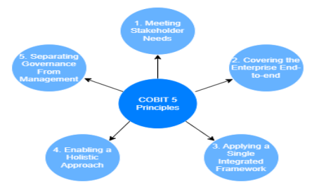
Figure 1. COBIT 5 Principles [17]

COBIT 5 is a business framework aimed at improving corporate governance and management. As an updated version of IT, it incorporates the latest thinking in corporate governance and management techniques and provides globally recognized principles, practices, analytical tools, and models to enhance the trust and value of information systems [14]. COBIT 5 is a comprehensive framework for IT management, covering both technical and non-technical aspects and addressing all aspects of information technology, including the fulfillment of stakeholders' needs [15]. The framework of COBIT 5 has fundamental principles for governance and IT management [16]. In order to improve IT governance within an organization, COBIT 5 applies five principles that should be considered, including: