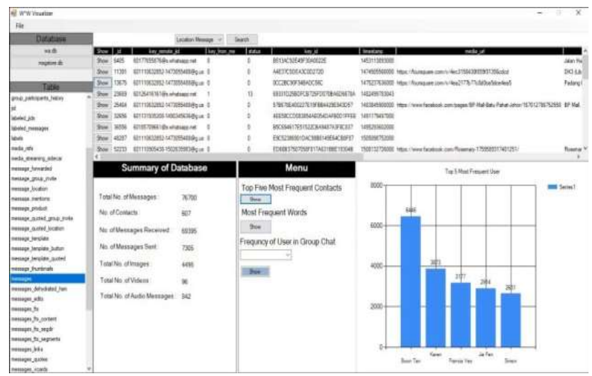
Fig. 1. Main Page of W*W Visualizer

For example, the Top Five Most Frequent Contact is displayed in a bar chart form that illustrates contacts' name and their total number of chats (see Figure 1). Similarly, the Top Five Most Frequent Users from group chats also present the contacts' name and total number of chat conversations. This feature assists investigators to identify salient contacts and infer their relations.