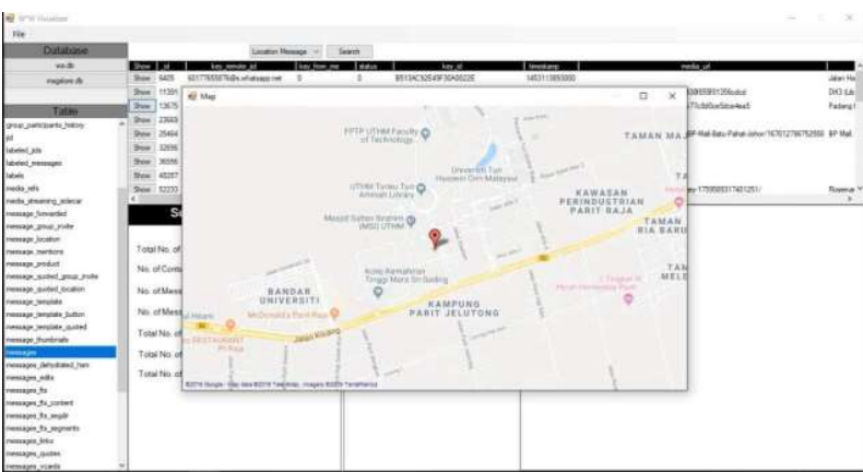
Fig. 5. Interface of Map Display from GPS Location

Sharing location is a common feature in any popular IM apps and would be one of the key metadata in an investigation. Investigating locations from raw data of IM database, however, would present investigators with GPS coordinates in which need to be manually search using other applications (e.g. Google Maps). Therefore, W*W Visualizer enables a pop-up map from GPS coordinates (see Figure 5). This feature is further indicates that visualization could influenced in minimizing tedious works and time taken, as echoed in Teerlink and Erbacher [30], and Koven et al [17].